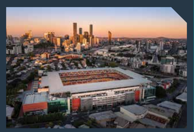
Suncorp Stadium

The Queensland Government is investing $5 million towards building a television hub on the Gold Coast and an additional $6.8 million for a new film studio in Far North Queensland to secure national and international productions.