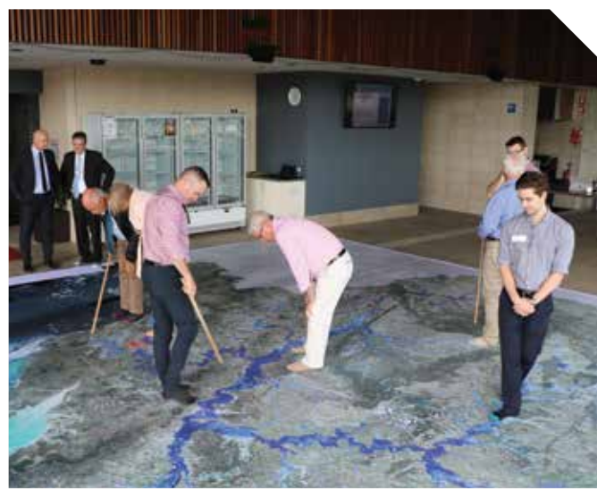
Resilience workshop

Queensland's emergency services teams already work collaboratively, however as their service models evolve, the way we plan and provide the supporting infrastructure must also adapt. There is a significant opportunity to co-locate complementary justice and public safety services, such as courts and police services, as well as explore different delivery models.