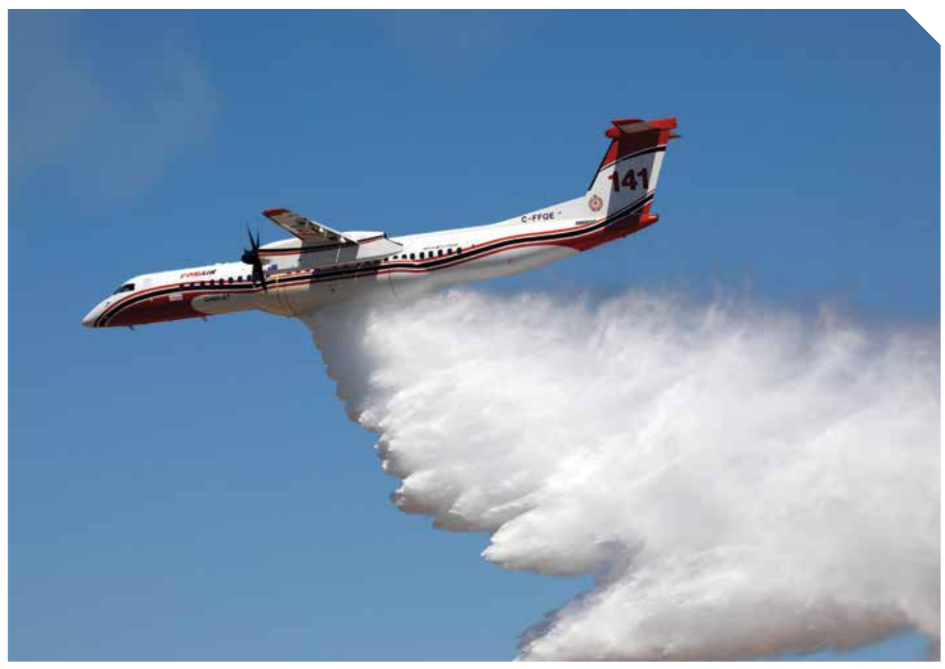
Large Aerial Tanker