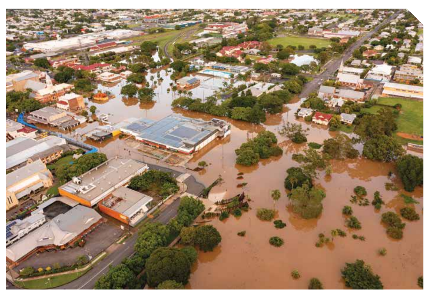
Flooding, Fraser Coast Shopping Centre

Ensuring infrastructure can withstand and function during disasters or emergency situations is a key government responsibility. We will use the best available data and evidence throughout the infrastructure lifecycle (planning, designing, construction maintaining and disposition) to constructing, maintaining and disposing) to better understand and respond to disaster and emergency risks and opportunities to strengthen infrastructure resilience.