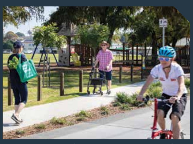
North Brisbane Bikeway

Sets the direction and focus for protecting and enhancing our environment for transport investments.